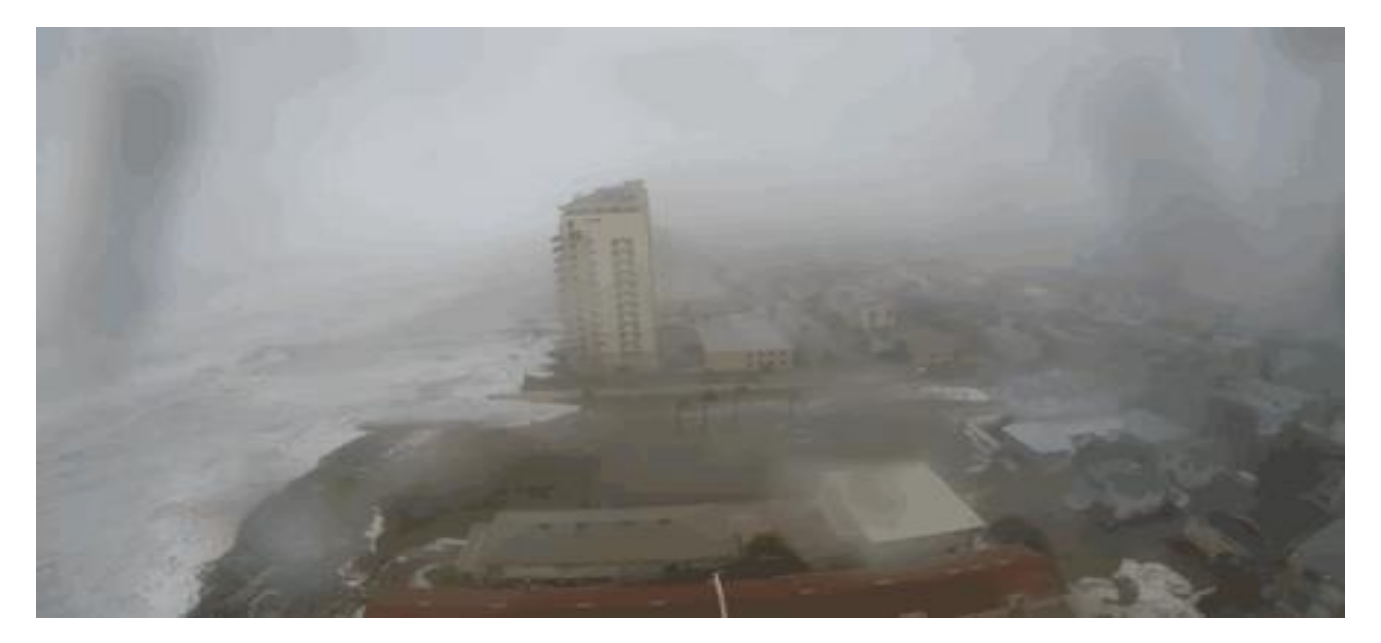
Figure 1.4: Coastal /Storm surge 2016

fortifications and the lowest elevation are the hardest hit. Low tide is the ideal time to strengthen the breach. See Storm surge crossing over barriers during Hurricane Michael,2016 in figure 1.4.