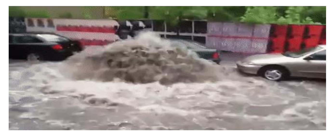
Figure 1.1: Flash flood (Ellicott City Floods of 2018)

Prevalent downpours rainfall, steep terrain, high surface runoff and mainstream length, extreme restoration, lack of sustainable flood-control measures, and global warming, among other factors, promote and exacerbate the risks, susceptibility, and negative consequences of nationwide flash floods (Elnazer et al.,2017; Miao et al.,2016; Perry, 2000; Youssef et al., 2011). However, multiple causal processes such as regional meteorological regimes, physical hydrological cycles, and anthropogenic cause flash floods to behave differently throughout time and location (Adnan et al.,2019; Merz, R., Blöschl, 2009).