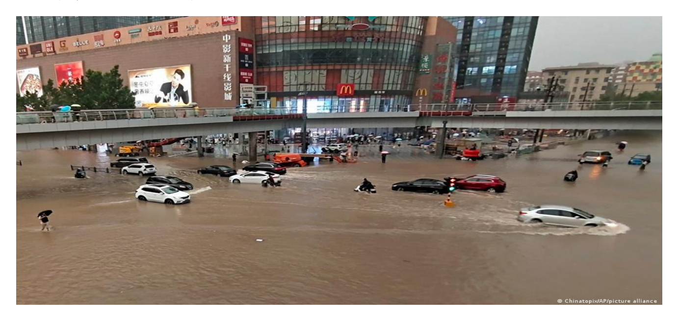
Figure 1.2: Flash flood, Henan province in China,2021