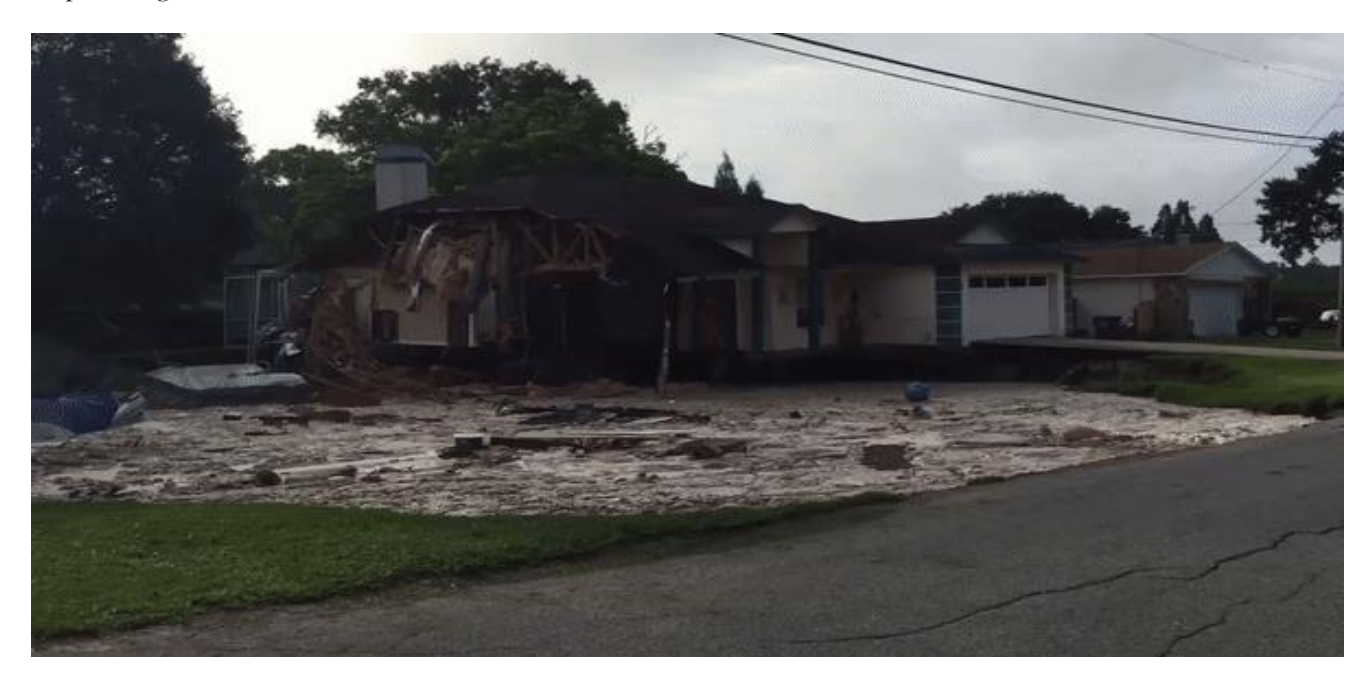
Figure 1.5: Urban/Ground waterflood (Florida 2017)

Whenever a city's or town's drainage system fails to absorb water from torrential rain, flooding occurs. Flooding can also be caused by a lack of natural drainage in a city. Water spills into the street, making driving extremely hazardous. Urban floods can inflict considerable structural damage even if the water levels are only a few inches deep. See figure 1.5.