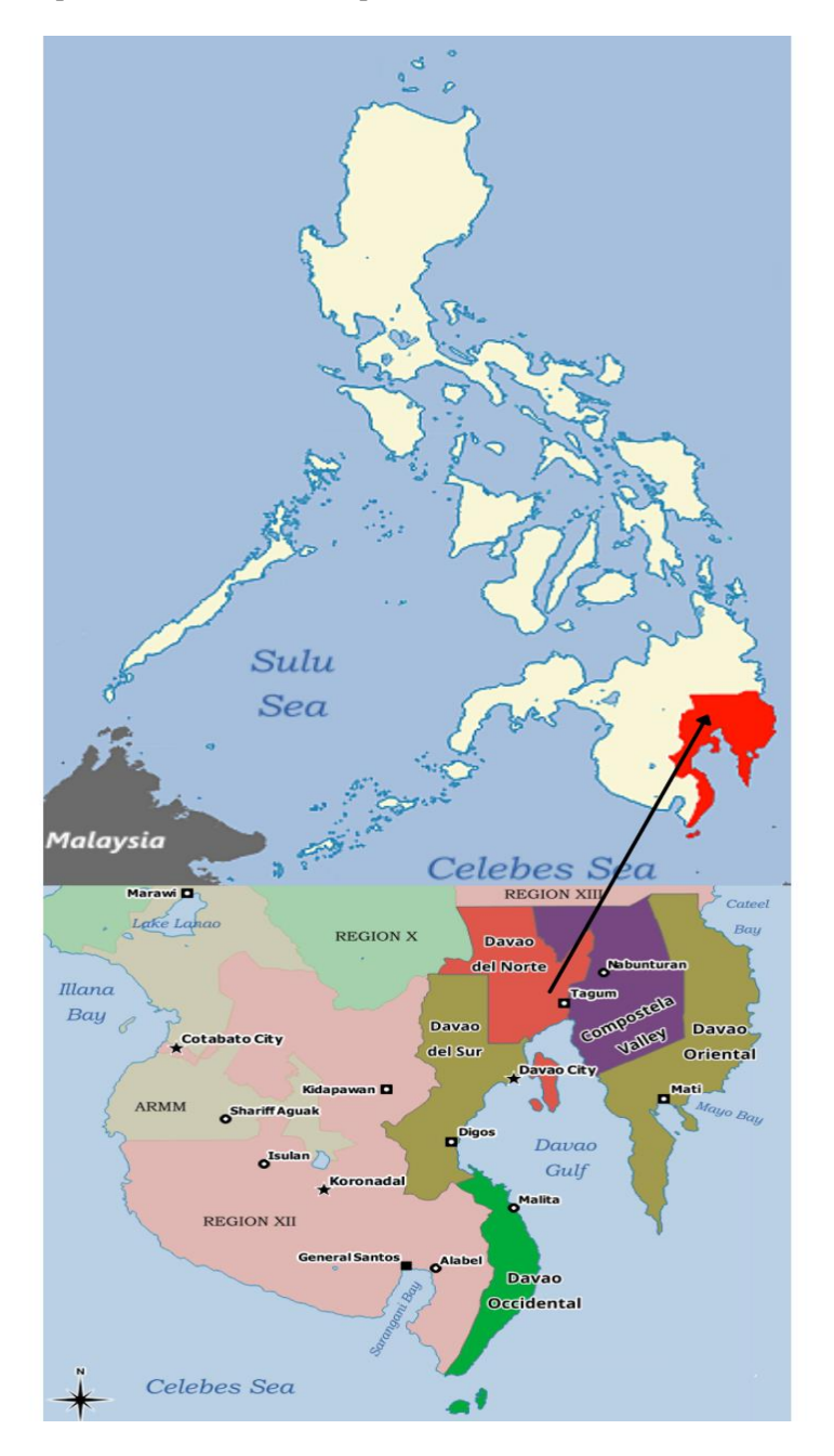
Figure 2. The Map of the Philippines and Southern Mindanao

The researcher had not come across a study describing the self-efficacy of public-school elementary teachers in Region XI. Hence, this prompted the researcher to explore the involved variables of her research.