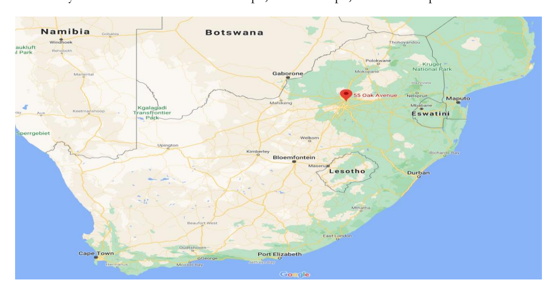
Figure 1. Sampling location

This research takes place in South Africa, in the province of Gauteng. The operators Head office is based in Centurion, but the study was not limited to Western Cape, Eastern Cape, Northern Cape and other Provinces.