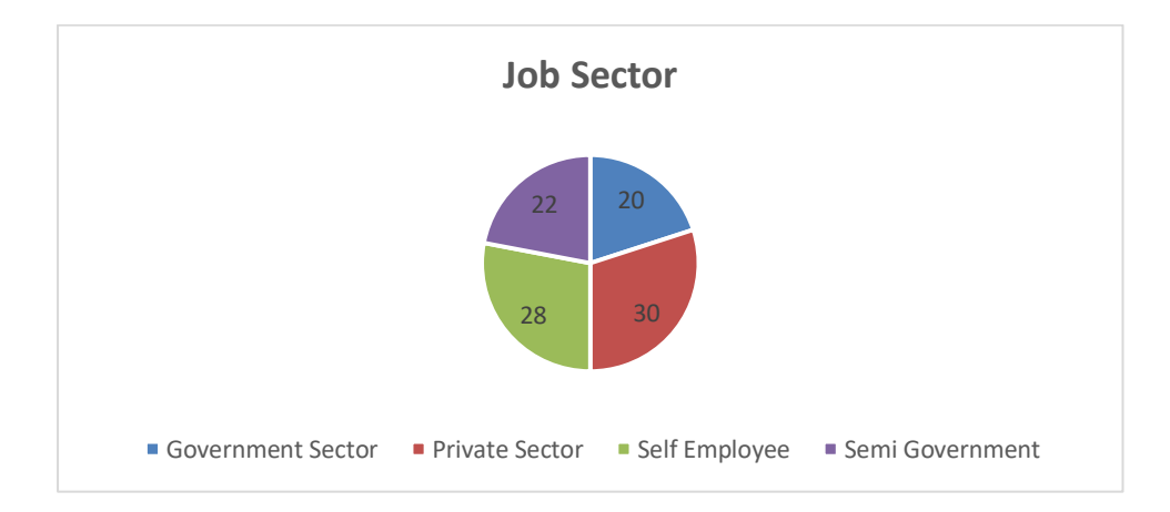
Figure 01: Job SectorWiseSample Composition